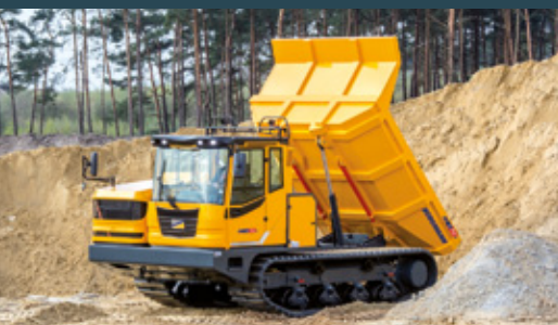
C912s | Rear tip dumper