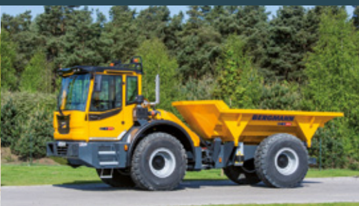
C815s | Three-way tip dumper