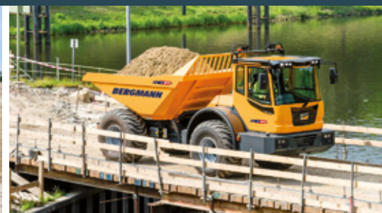
C815s | Swivel tip dumper