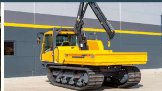
C912s | Carrier vehicle