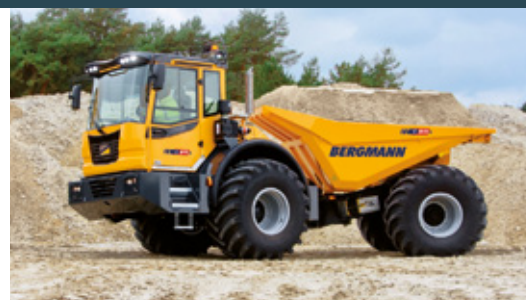
C815s | Rear tip dumper