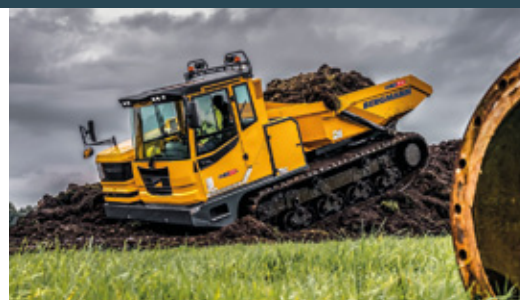
C912s | Swivel tip dumper